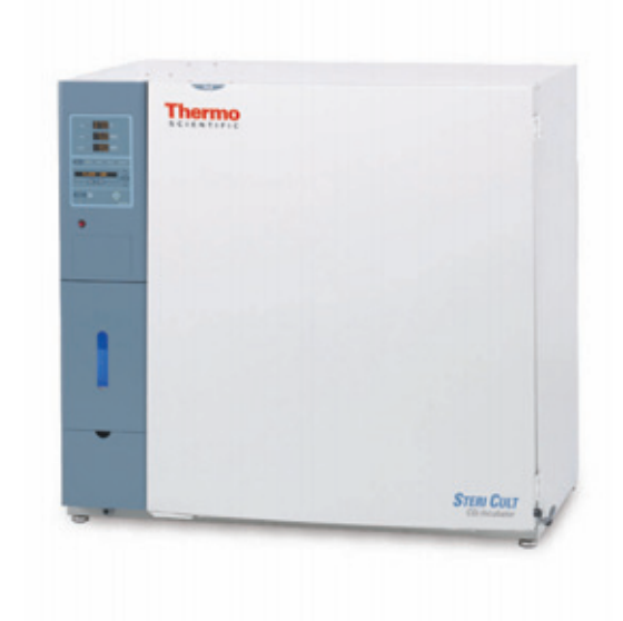
figure 1-Steri-Cult CO<sub>2</sub> Incubator with Class 100 Air

Class 100 air is achieved and maintained within the Series II Water Jacketed, Steri-Cycle, Steri-Cult, and Steri-Cult R CO<sub>2</sub> Incubators by way of our advanced incubator design and HEPA Filter Airflow System.*