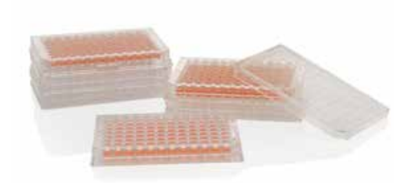
Nunc standard plates