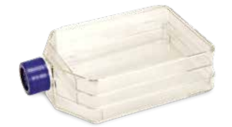
Nunc TripleFlask flasks