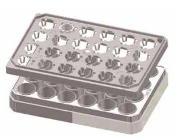
Nunc carrier plate system