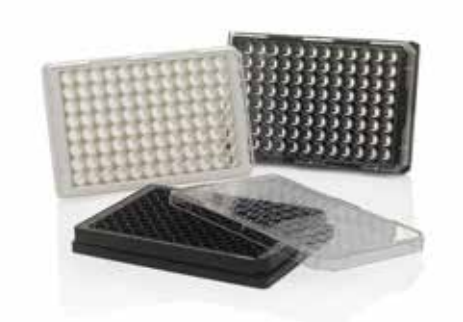
Nunc optical bottom plates