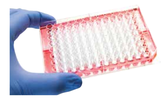
Nunc Edge 2.0 plate

• With superior imaging quality, and minimal background noise and crosstalk between wells, these plates are optimized for fluorescence and luminescence imaging applications