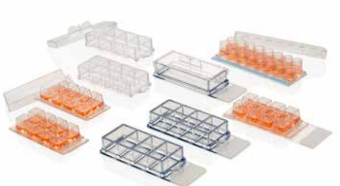
Nunc chamber slides

• Ideal for cell karyotyping using single-cell autoradiography or single-cell immunofluorescence