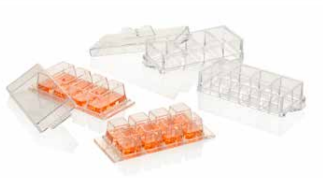
Nunc chambered coverglasses