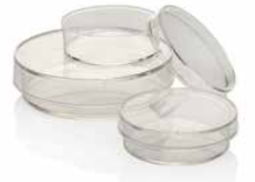
Nunc standard dishes