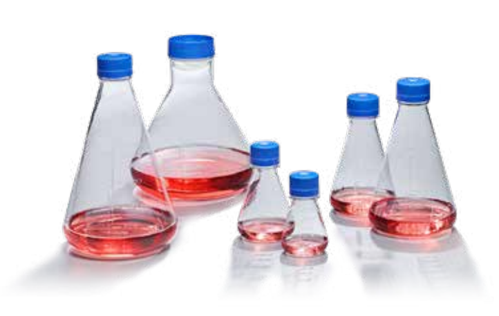
Table 7. Nalgene single-use PETG Erlenmeyer flasks.