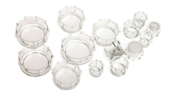
Nunc cell culture inserts